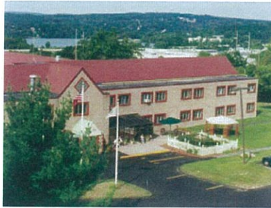
The Independent Order of Odd Fellows is proud to sponsor many Housing Projects throughout North America.